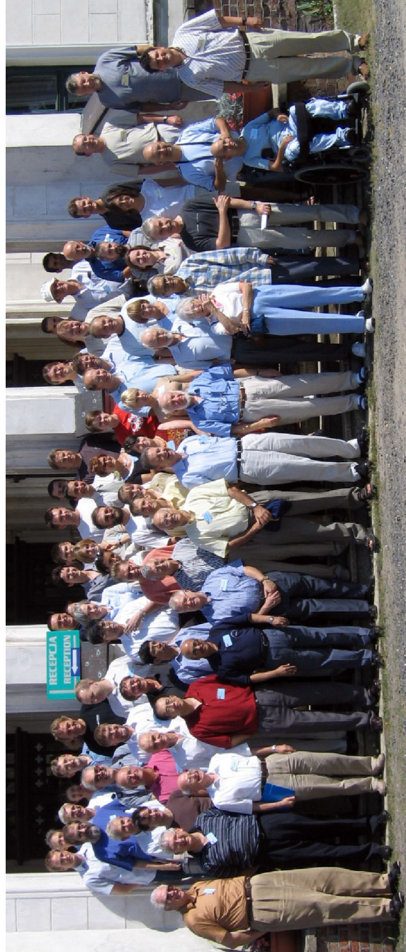
PHOTO 10. Będlewo, 19–21 August 2004, IWMS#13. Celebrating Ingram Olkin's 80th birthday.