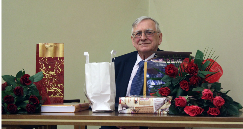
PHOTO 1. Zielona Góra, 12 March 2016, Jubilee of the 70th Birthday.